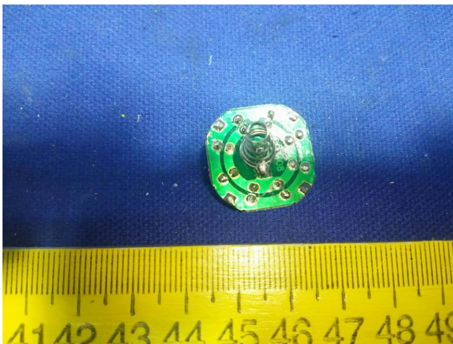
Electric Circle View of P51327