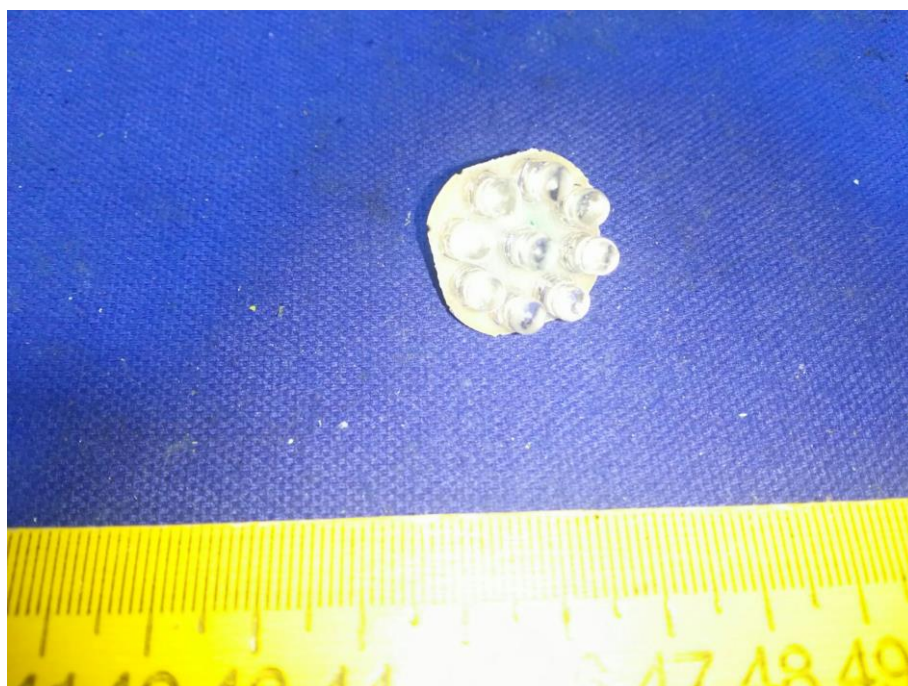
LED view of P51327