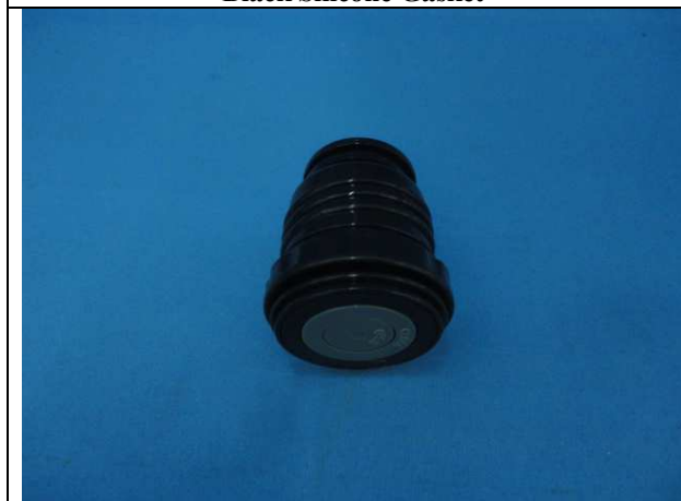
Black PP Lid & Gray ABS Button