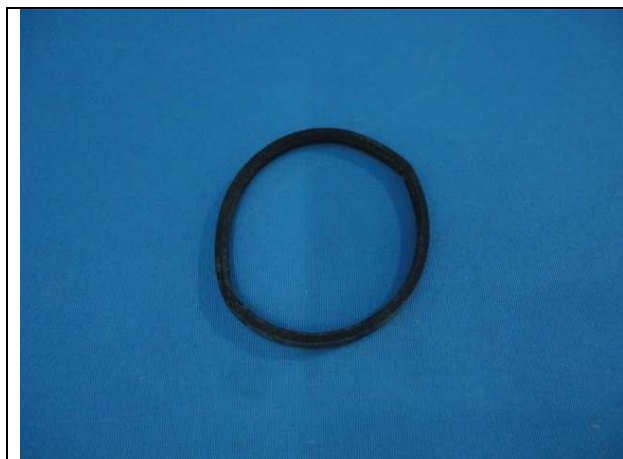
Black Silicone Gasket