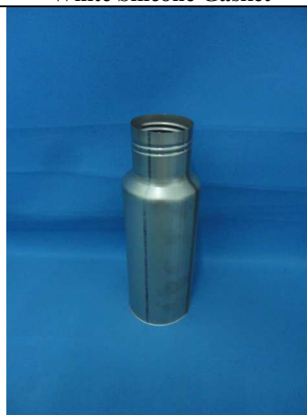
Stainless Steel Inner