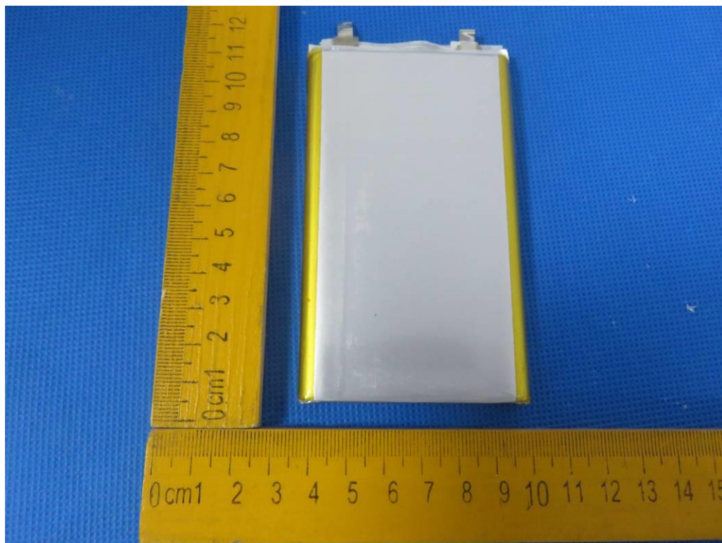
Figure 2 Back view of cell