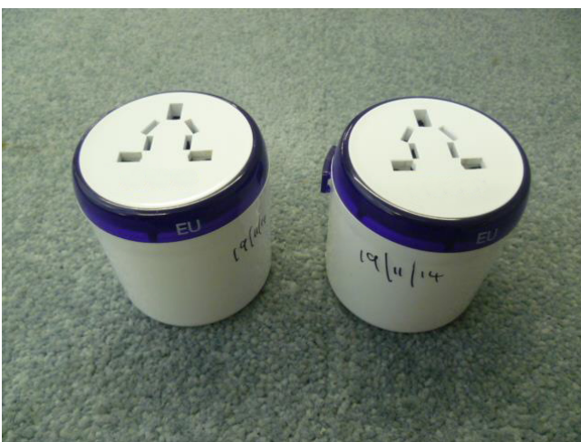
Models 260 & 261

The samples comprise of two travel conversion adaptors 260 & 261. Each adaptor is barrel shaped and comes with the plug pins retracted. The ring on the body of the adaptor is twisted in order to engage the slider for the desired plug pins for the country required. Only the plug pins in use are connected to the socket outlet portion of the adaptor. The retracted pins are disconnected from the supply when not in use. The multiple socket outlet portion of the adaptors has multiple apertures and accepts BS 1363 plugs and also Europlugs, US plugs & AS/NZS plugs for class II appliances. The apertures for BS 1363 plugs and for European plugs are shuttered, whereas the apertures for the US and AS/NZS plugs are not.