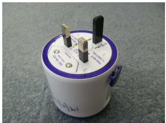
Model 260 with UK plug pins extended