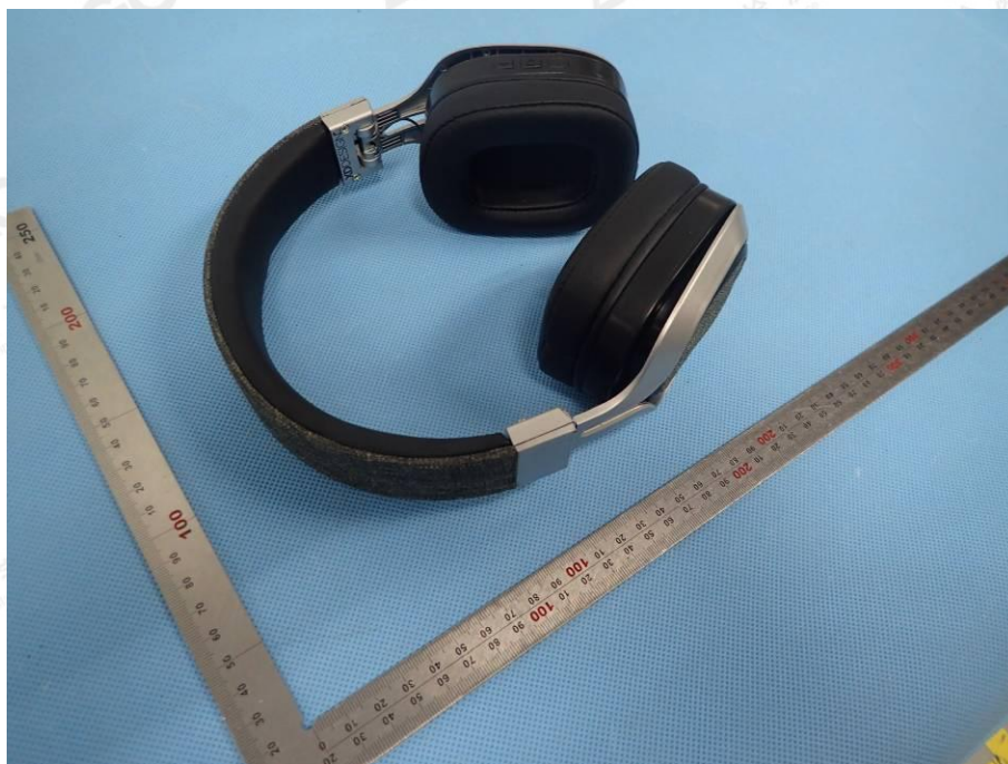
Fig.1 – overview