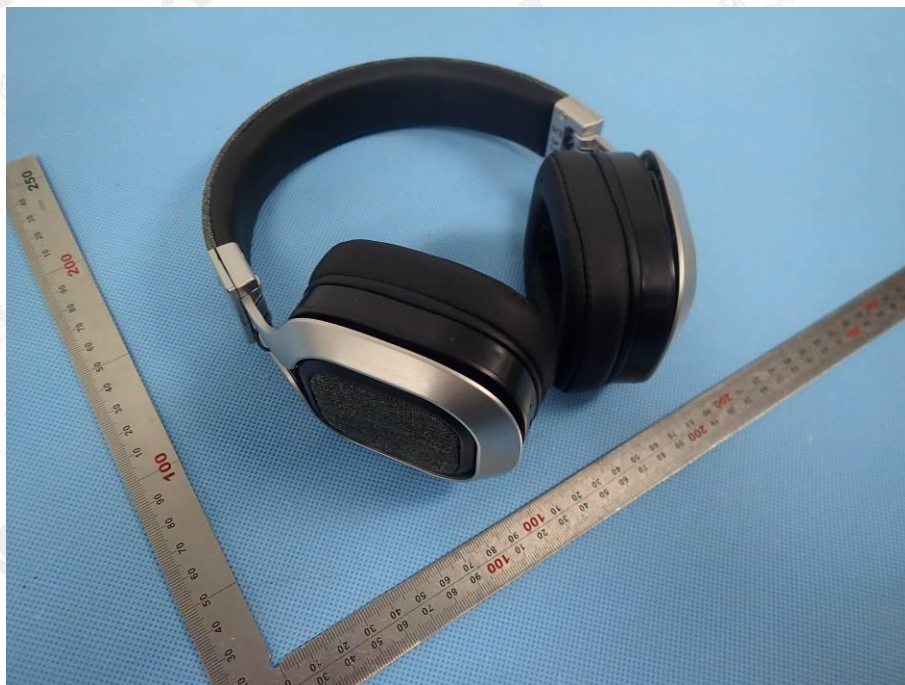
Fig.2 – overview