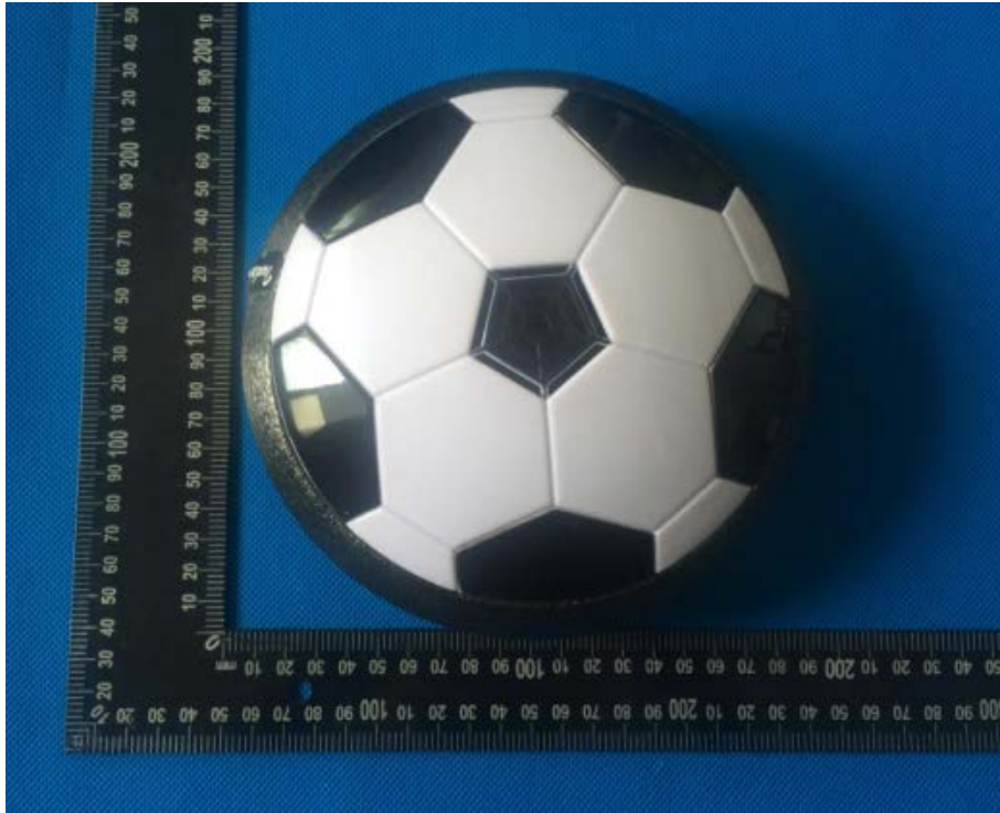
Photo Appearance of Sample