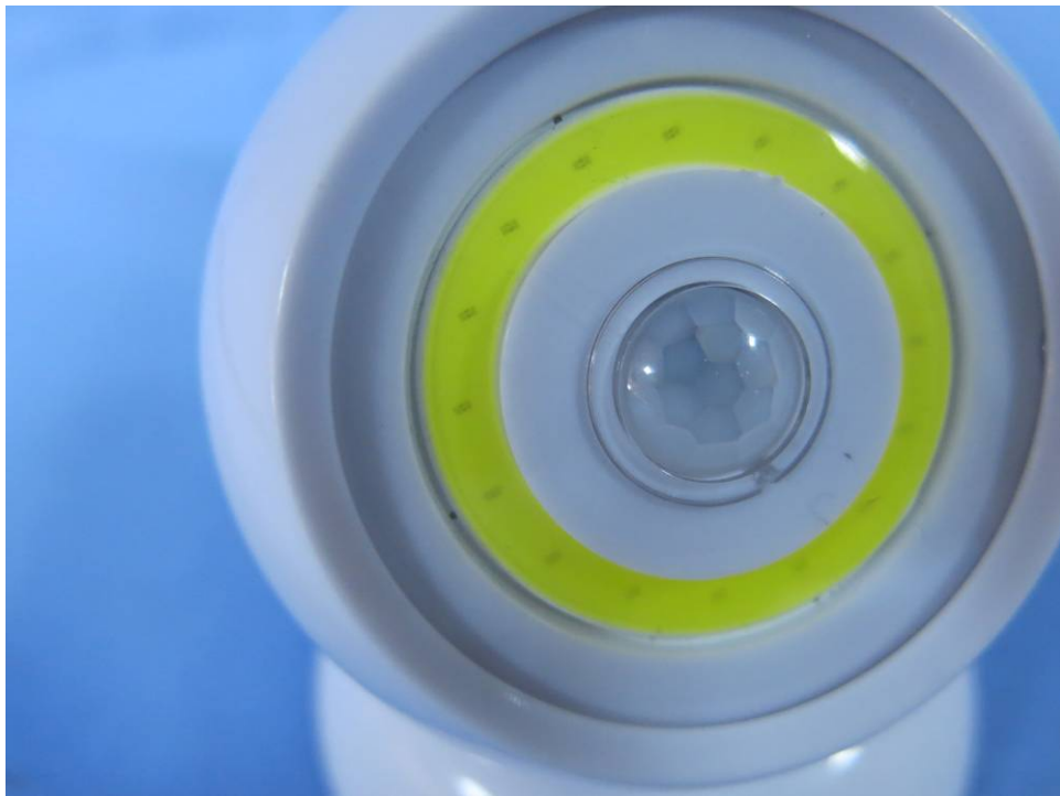
Fig 2 - LED view