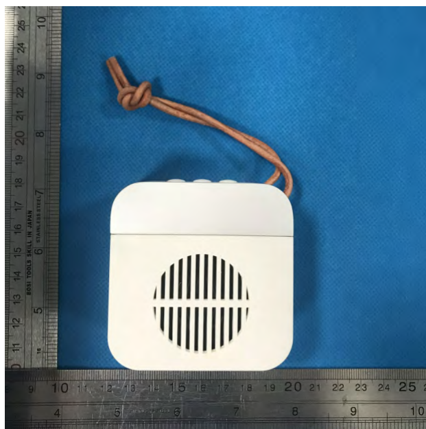
Photo 2 Appearance of EUT