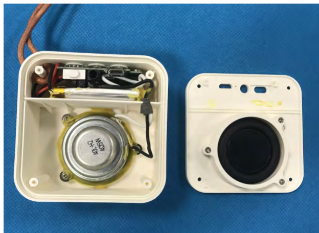
Photo 4 Appearance of EUT