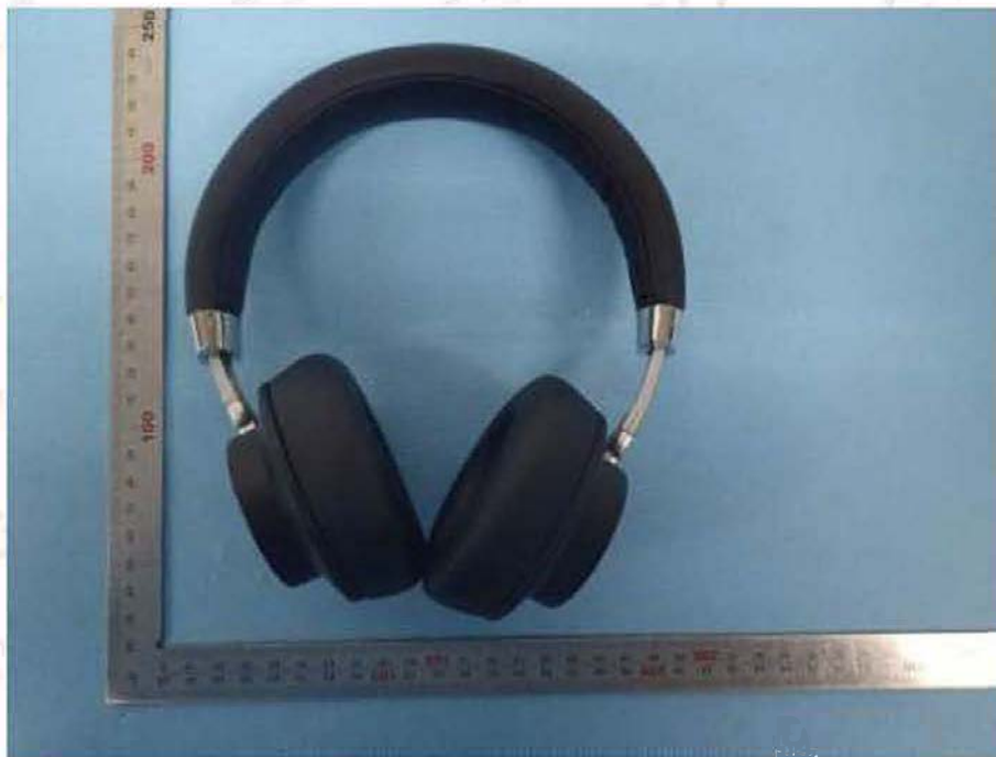
Fig.1 – overview